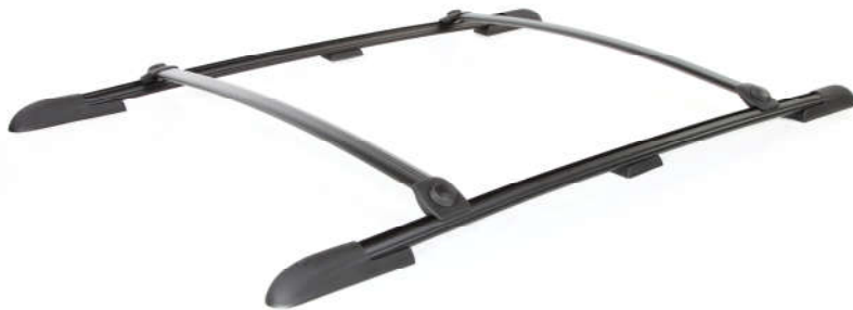
Image is not representative of actual number of rail posts.